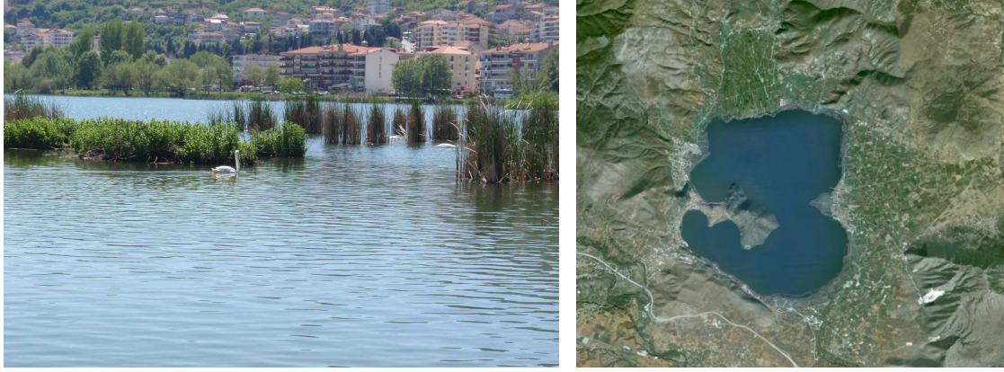
FIGURE 1. Photo (left) and satellite image (right) of Lake Kastoria. Nine rivulets flow into the lake; its depth varies from nine to ten meters which defines the lake as a shallow one.

and money spent to visit the lake, (iv) the time and money the interviewees spent to visit the lake, as well as other dependencies (all taken as independent variables) are estimated by means of Logit, Probit, Logistic and Linear Regression Models.